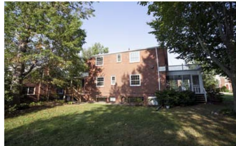
REAR VIEW OF HOME AND YARD