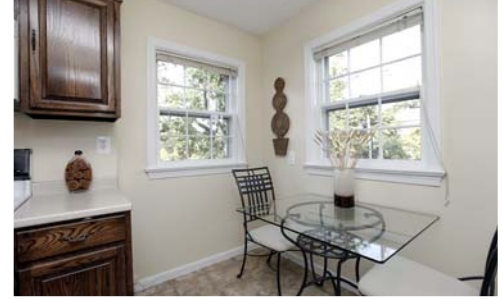
SUNNY EAT-IN KITCHEN