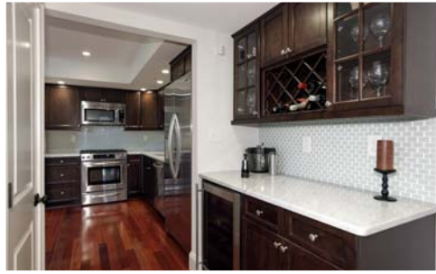
BUTLERS PANTRY & VIEW INTO KITCHEN