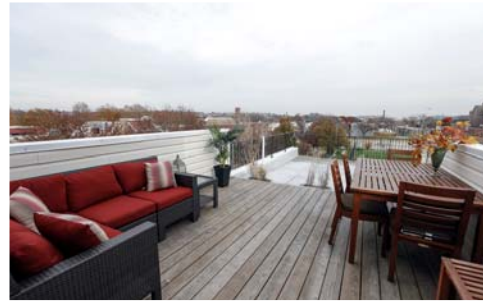
ROOF TOP DECK